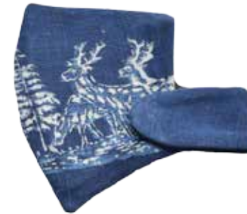
[Protective cover blue ] [with print]

- If no logo is selected, Kohnle Hawk is lasered by standard - Logo / requested text