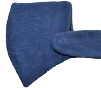
[Protective cover blue ] [without print]